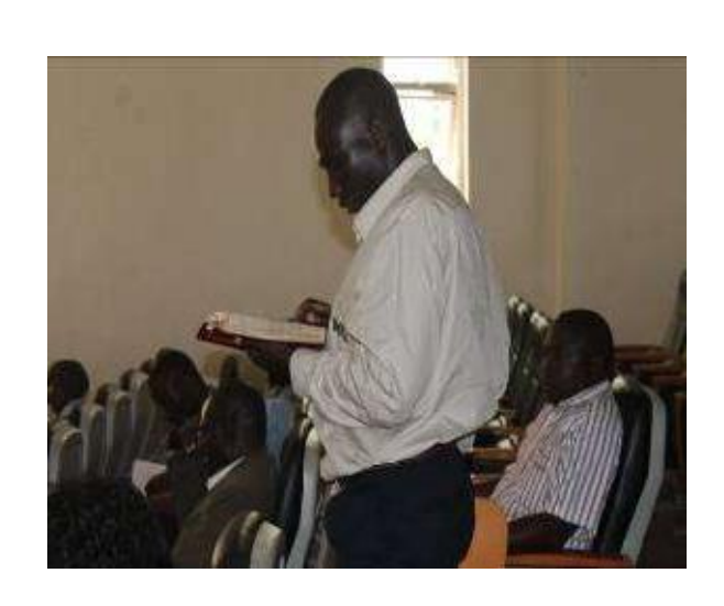
A pastor reads out a verse in the bible

The environment enables the creators to thrieve and treats it as it's for someone else God explains his love for the environment by creating biodiversity in our homes.