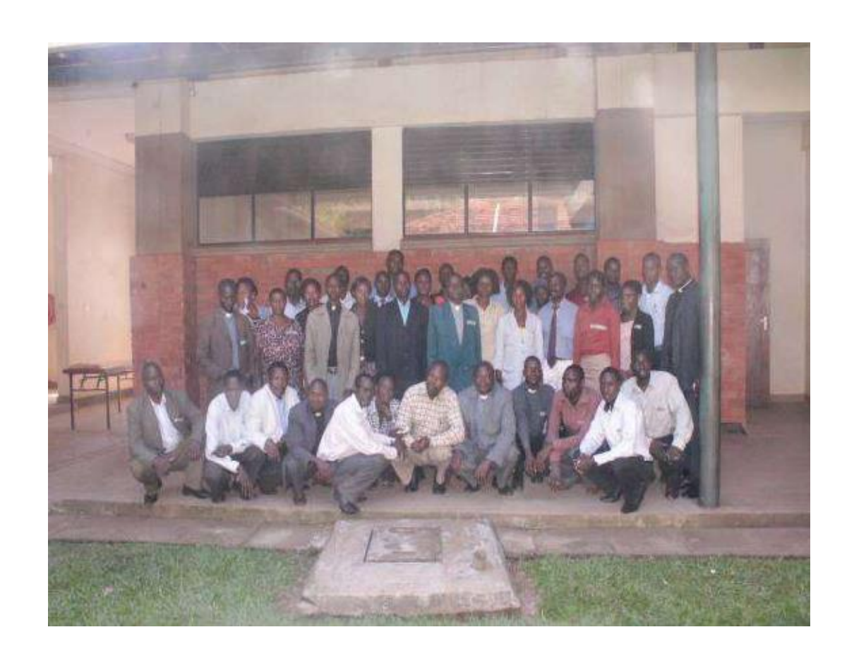
Held at Makerere Faculty of Food Science 05 February, 2013