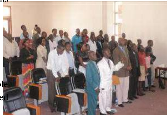
Members singing a worship song

Pictures in the study book were projected showing a cup of coffee, small coffee table and cardboard package of biscuits. He asked the participants after the projection, how many such items do you think may be purchased throughout the world?