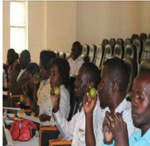
Participants tease out their sense of smell

Members were asked to mention the five senses they have been given by God, among the five these were mentioned; sense of feeling, hearing, and smelling, tasting, sight.