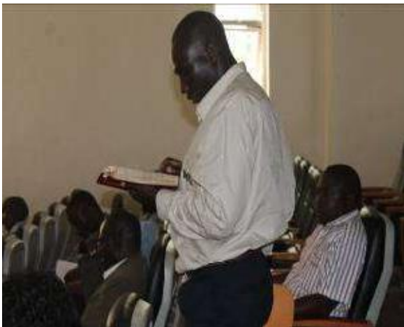
A pastor reads out a verse in the bible

The environment enables the creators to thrive and treats it as it's for someone else God explains his love for the environment by creating biodiversity in our homes.